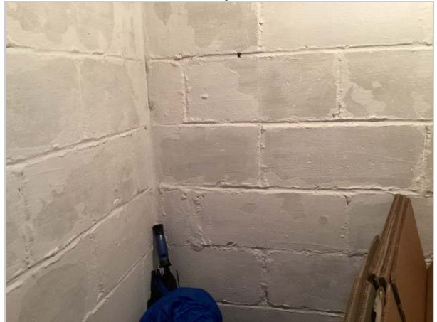
Evidence of moisture under front porch

The basement ceiling is water marked below the living area from what appears to be a previous leak. The area was dry at the time of the inspection. No immediate action is required. The area should be monitored for evidence of new leaks. Consult with a qualified contractor for repair if required.