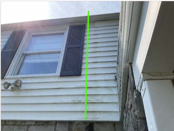
Evidence of leak from behind