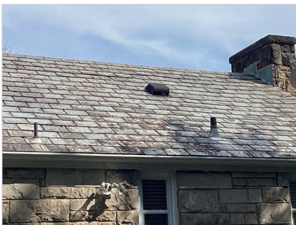
Original slate roof

The roof was a gable design covered with slate. Observation of the roof surfaces, flashing, skylights and penetrations through the roof was performed from the ground level with the aid of binoculars. We will access the roof as long as it is dry, has a pitch that can be safely walked and accessible with the 16 foot ladder we carry. The age of the roof covering, as reported by the MLS sheet, was unknown. There was one layer of slate on the roof at the time of the inspection. These conditions indicate the roof slate were near the end of their useful life as they appear to be original to the home.